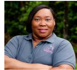
Kesline specializes in scratch-made desserts that celebrate life's sweetest moments