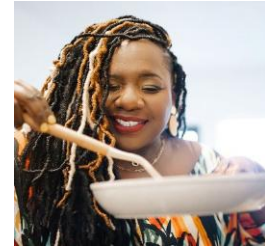
Trindy Gourmet is an award-winning restauranter specializing in combining BOLD flavors with "trindy"

by Ganache Bakery Vanilla, chocolate, lemon, pistachio, coconut, red velvet Edible paper logo on top