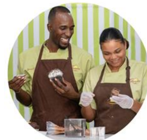
Award winning bakery as seen on the Food Network, featured in the Palm Beach Post and the Palm Beach Food & Wine Network